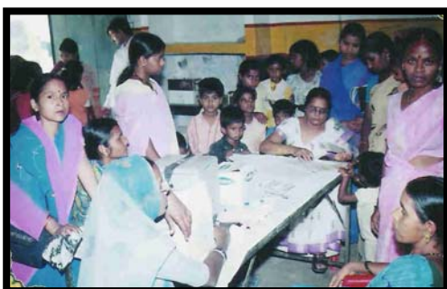
Swastya suchana Avam Seva Kendra – Rakhukhor

The organization has come up with the concept of community driven Swasthya Suchana Avam Seva Kendra to improve service delivery to the target groups. This Kendra is equipped with essential medicines for childhood illnesses, contraceptive supplies, treatment and management of STD/RTIs, and general ailments. Doctors visits once a week in each of these kendras. Patients visiting these centers are be levied a nominal user charge of Rs. 5- 10/- for availing the services. Appropriate linkages and referrals are also built with the block level PHC to manage the high risk and complicated cases.